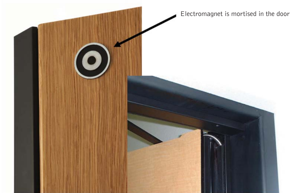
Semi - Concealed loop runs through hinge and frame