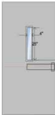
Elevator doors opening center