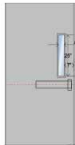
Elevator opening right to left